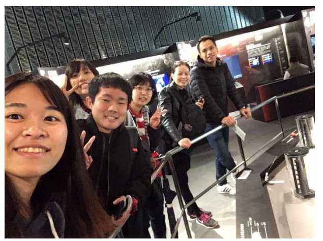
Visit to the science museum, MIRAI-KAN, on Nov. 24 with Tokyo NODAI students.