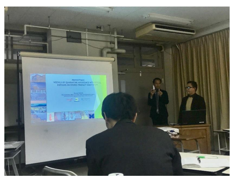
Final presentation by one of the trainees on Dec 17 at Tokyo NODAI