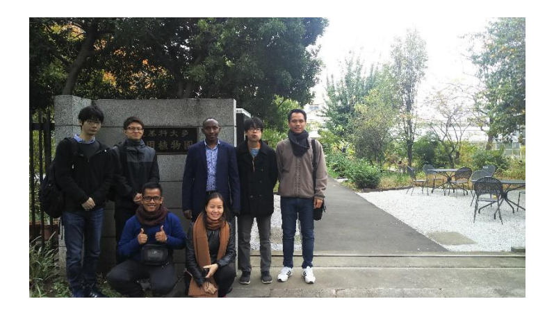
The visit to Medicinal botanical garden of Hoshi Pharmaceutical University on Nov. 24.