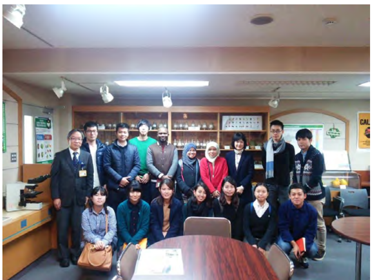
A group photo at the visit to Yokohama Plant Quarantine Office, MEXT, Japan.